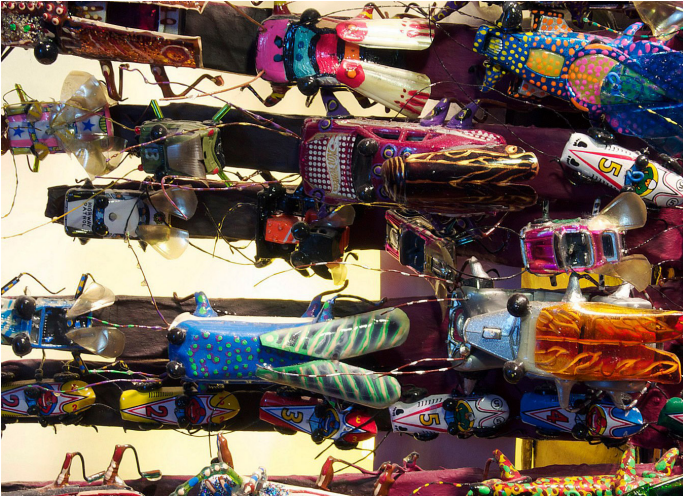
Pirkko Fleig (*1958, lives in Piedmont, Italy)

Due to a lack of finances, Pirkko Fleig, a trained carpenter, has been collecting trash for many years – her own and that of acquaintances, found or created. Nothing is bought, not even at the flea market. Everything is stored in large drawers until they overflow. Then everything is re-purposed: the plastic parts, empty bottles of brandy or nail polish or perfume bottles, toy cars, Playmobil parts, glitter garlands, rick rack, fabric and plastic ribbons, champagne and bottle caps, Barbie dolls, chocolate wrappers, squeezed tubes and all the trifles that accumulated for years. Since 2006, Pirkko has also been making illuminated objects. Initially, it was a gimmick that enabled Pirkko to give her friends and acquaintances original and inexpensive gifts. Over time, the “jellyfish”, “beetle”, “male”, “circus” and so on lamps developed into a great passion and a distinctive trademark. In a process that sometimes lasts for years, the odds and ends are carefully processed to shine in new, unprecedented splendor. The sight of the glamorous objects makes you forget that they all came from the worthless trash of our throw-away society. They would fit perfectly into the grotesque ambience of Grock’s Villa, which happens to be not far from Fleig’s chosen home in Piedmont.